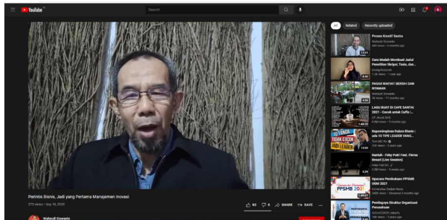
Figure 3. Entrepreneurship Learning Model with Innovation Management Debriefing

Products that have been produced and tested in class are textbooks and videos uploaded on youtube. Videos about entrepreneurship material are deliberately uploaded to youtube because the learning model applied is free. These videos are examples of learning models about entrepreneurship that can be imitated and applied by students. The video can be accessed by all interested students, so it is in accordance with the principle of independent learning.