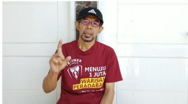
Figure 10. Entrepreneurship Learning Model with Application of Honesty and Spirituality

In this video, an entrepreneurial learning model is depicted that is associated with religious spiritual learning. In this learning model, students are not only more innovative but also more religious.