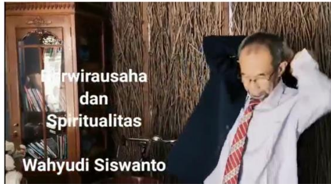
Figure 9. Entrepreneurship and Spirituality Learning Model

In this video, an entrepreneurial learning model is depicted that is associated with religious spiritual learning. In this learning model, students are not only more innovative but also more religious.