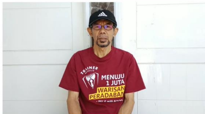
Figure 8. Entrepreneurship Learning Model with Hard Work

In this video it is illustrated how the entrepreneurial learning model can be applied and associated with honesty. In this learning model, many examples are that one of the keys to success in entrepreneurship is honesty. The courage to speak honestly in public is the basic capital of entrepreneurial learning. Because public speaking makes a person more confident (Siswanto et al., 2019).