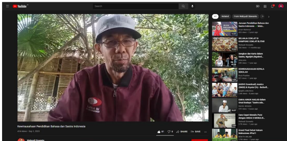
Figure 4. Entrepreneurship Learning Model Associated with Indonesian Language and Literature Education

The second video is an entrepreneurial learning model for independent learning related to language and literature education. There is no word that you can't be entrepreneurial even though the chosen major is Indonesian language and literature education. Many things can be done with the independent learning program, students can be entrepreneurial even though they are studying or working in education. All objects of science are entrepreneurial lands (Danil, 2021). So, students with any knowledge base have the opportunity to be entrepreneurial.