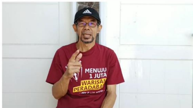
Figure 7. Entrepreneurship Learning Model with Honesty

In this video it is illustrated how the entrepreneurial learning model can be applied and associated with honesty. In this learning model, many examples are that one of the keys to success in entrepreneurship is honesty. The courage to speak honestly in public is the basic capital of entrepreneurial learning. Because public speaking makes a person more confident (Siswanto et al., 2019).