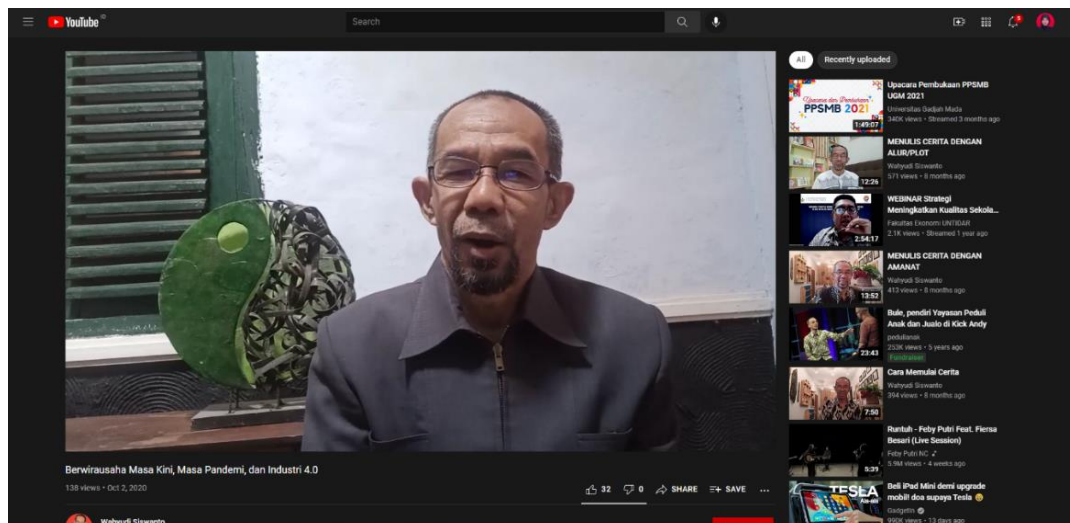
Figure 5. Today's Entrepreneurship Learning Model, Pandemic Period and Industry 4.0

The second video is an entrepreneurial learning model for independent learning related to language and literature education. There is no word that you can't be entrepreneurial even though the chosen major is Indonesian language and literature education. Many things can be done with the independent learning program, students can be entrepreneurial even though they are studying or working in education. All objects of science are entrepreneurial lands (Danil, 2021). So, students with any knowledge base have the opportunity to be entrepreneurial.