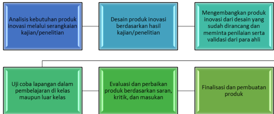
Figure 2. Development Pipeline